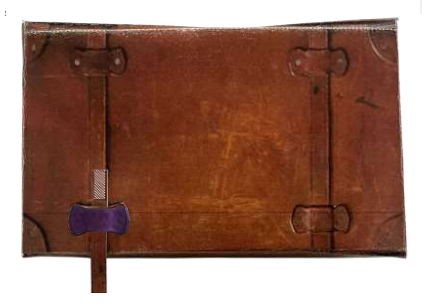
8. Next ontop of the suitcase: Glue only one end of the long strap down onto the buckle. Then glue the buckle strap holder ontop of the long strap. Repeat this on the other side. You should have 2 long straps ends loose with both buckles firmly glued down.