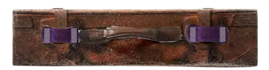
7. You'll see on the suitcase a blue buckle strap holder near the handle, this is where your buckle straps will go. For your 1st buckle, glue the ends and not the middle. Place next to the strap. The long straps will thread through this to secure the suitcase. Repeat on the other side.