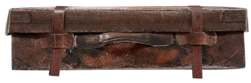
9. And your finished! You can now close your suitcase by tucking in the straps to secure it shut.