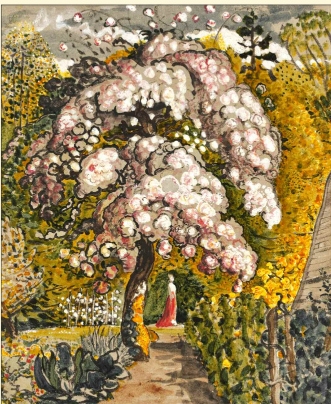
Right 'The Magic Apple Tree'. Such incredible profusion and fecundity is typical of Palmer's visionary landscapes.