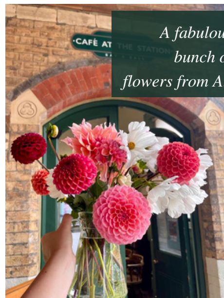
A fabulous bunch of flowers from Ali