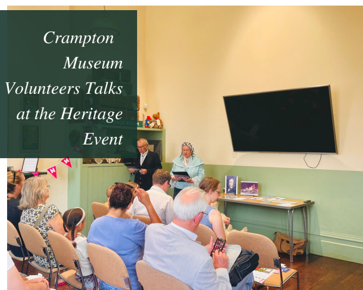
Crampton Museum Volunteers Talks at the Heritage Event

It was a wonderful day to celebrate Bat & Ball Stations Heritage, with over 300 people attending from not only Sevenoaks but broader Kent. We hope to host another Heritage Open Days event next year, if you missed it- come along to the next!