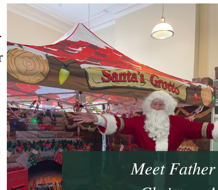
Meet Father Christmas!