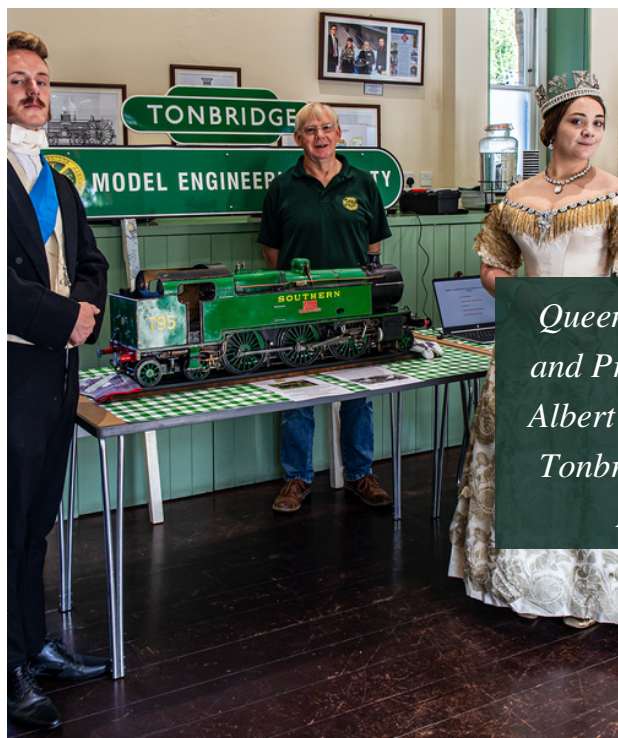
Queen Vic and Prince Albert with Tonbridge MES