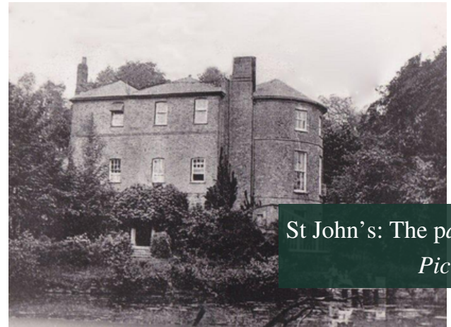
St John's: The past in Pictures

29th February 6pm - 7:30pm Book through our website