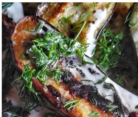
Snap shots of Supper Club dinners!