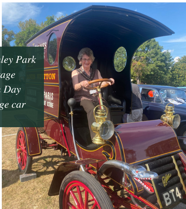
Swanley Park Heritage Open Day vintage car show