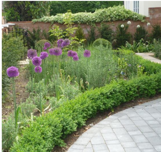
An example of a typical Victorian garden planting scheme

Volunteers have created a plan and discussions with garden designers have taken place regarding planting schemes. Areas around the station entrance and bike racks will be planted with lavender, roses, wild flowers and herbs which can be used by the café. Box hedging and brick paths will also be a feature, typical of a Victorian style garden.