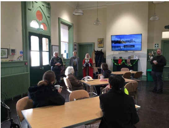
Forget-Me-Not Cafe opening

Similar to our Warm Spaces mornings, we have started up a new Forget-Me-Not Café at the Station. Forget-Me-Not Cafés are a place where anyone with memory loss, their carer or family may find friendship with like-minded people and signpost to more formal help if so desired. These cafes are a life line for many families, to feel safe and enjoy some happy social time over a cup of tea or two.