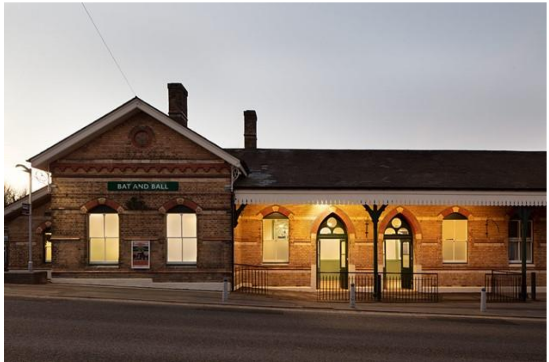
An old photo but the Station looking wonderful in evening

Opening times: Monday - Friday 6:30am - 2pm Closed from 24 th Dec- 2 nd Jan 2023