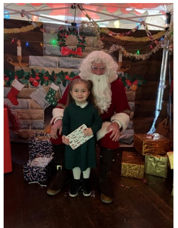
Visitor holding a Christmas gift from Father Christmas

Father Christmas made his special appearance at the Station on the 10th December, bringing all his Christmas cheer and presents for children who visited him in his wonderful grotto. As part of the event, children could make Victorian inspired crafts such as Christmas crackers, paper angel decoration, and Christmas cards for Father Christmas. Children had a wonderful time meeting him and learning a little about how Christmas through the Victorians. I would like to thank our Father Christmas, who kindly gifted his time to make all the children and families very happy! If you'd like to see the cards made at the event, they are on display in the Station Cafe.