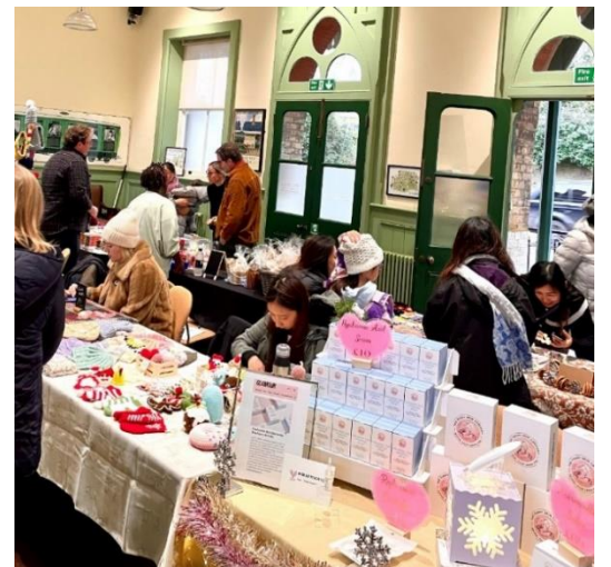
Christmas Craft Market

Twelve stall holders joined us, showcasing knitting, chocolate, jewelry, skincare and more; all individual businesses and a few new businesses from the Sevenoaks area. The Station café opened especially during this market as well, making a good profit and driving customers through to the market. As this was our first market, there were a few tweaks to be made and things to be improved for next year!