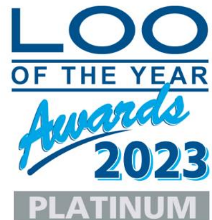
Loo of the Year Award to the Station

Beginning the year with a good start, our Station Platform Loo's were awarded Loo of the Year 2022! In our restoration project, having a functioning station toilet was very important issue; before the restoration, the Station was in disuse and there was no functional toilet which was a great concern for many residences in the Sevenoaks Community. We're proud to have been awarded this, as it not only shows how important a Station toilet is but how hard our staff work to keep it in tip top condition!