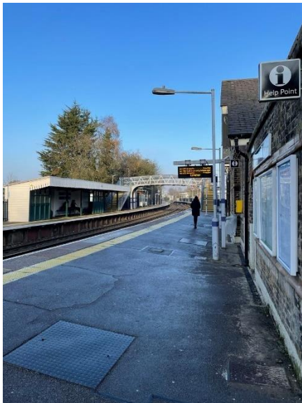
The Station a few days before the snow came, it looks very cold!

The purposes of these spaces are for people who might be struggling with the cost of energy crisis and would like to visit a non-judgmental warm space. Around the UK, many households are struggling with the cost of living, often having to make the decision between feeding their family or turning the heating on. Due to this, Councils have been taking the initiative to set up 'signposts' for public places that cater to families. Although our café is open during the week until 2pm, we wanted to open up our Station Booking Hall for families or individuals needing a free warm space and also chat to volunteers who assist running the mornings.