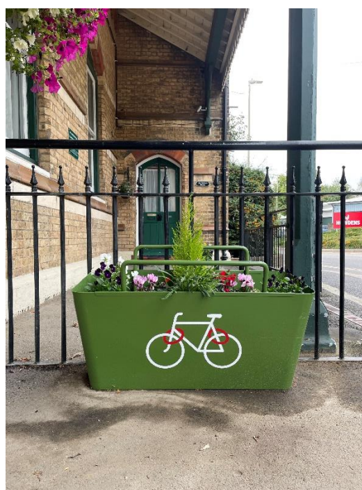
Cycle Planter gifted to the Station by The Cycle Friendly Scheme

This year we also welcomed our Cycle Friendly Accreditation for the Station Café. We are keen to make the whole of our Station more accessible for all, and being environmentally friendly. Being awarded a Cycle Friendly Place 2022 means we have secure bike friendly storage, bike maintenance kit, list of cycle repair shops near by, cycle clothes wall hook, and our warm café to cyclists to visit! We also received a free cycle planter from the Cycle Friendly scheme, which Linda our gardener has kindly planted up for us!