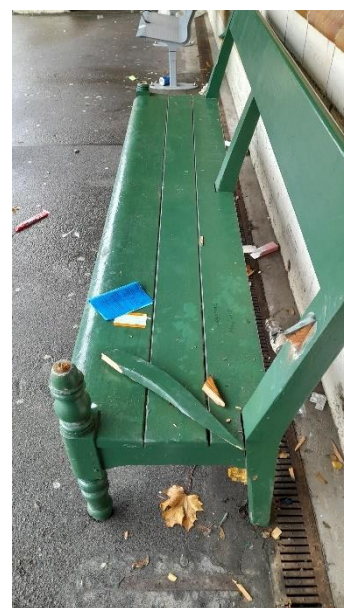
Current damaged bench

Sadly, since this our original railway bench was damaged by vandals; wanting to lift the bench off the ground aside from it being bolted to the platform, and resulting in the bench arms being snapped off. It's a great shame