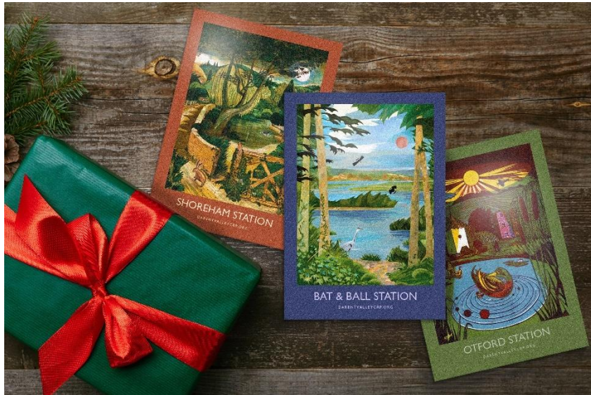
New DVCRP poster cards