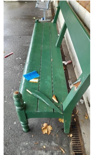
Current damaged bench

Trust has kindly rewarded us with a grant for the bench, and which will be built at the beginning of 2023. Sadly, since this our original railway bench was damaged