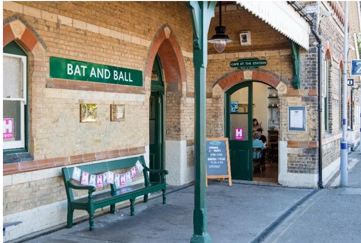
Heritage bench at Heritage Open Days in 2019

When we first opened the Station, our wonderful South East & Chatham Style Bench has been displayed outside on Platform 2. The bench has added to our Heritage status at the Station but also providing seating for those visiting the café, Station, or railway. We recently enquired into funding a replica of this bench to match the original and will replace the current metal South Eastern bench in situ. Railway Heritage