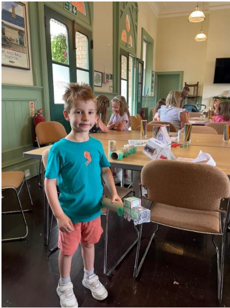
Attendee proudly showing off their trains!