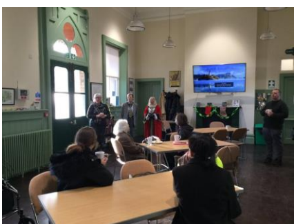
Forget-Me-Not Café opening

Similar to our Warm Spaces mornings, we have started up a new Forget-Me-Not Café at the Station. Forget-Me-Not Cafes are a place where anyone with memory loss, their carer or family may find friendship with like-minded people and signpost to more formal help if so desired. These cafes are a life line for many families, to feel safe and enjoy some happy social time over a cup of tea or two.