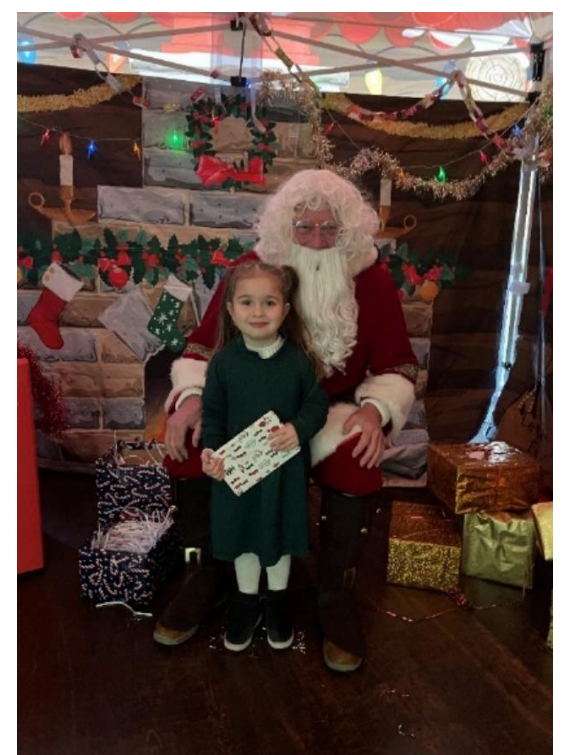
Visitor holding a Christmas gift from Father Christmas