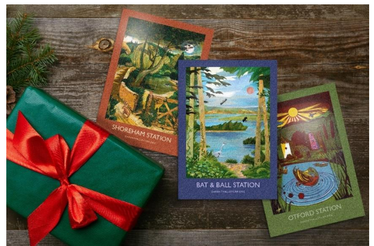
New DVCRP poster cards