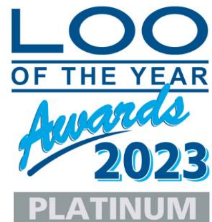
Loo of the Year Award to the Station

Beginning the year with a good start, our Station Platform Loo's were awarded Loo of the Year 2022! In our restoration project, having a functioning station toilet was very important issue; before the restoration, the Station was in disuse and there was no functional toilet which was a great concern for many residences in the Sevenoaks Community. We're proud to have been awarded this, as it not only shows how important a Station toilet is but how hard our staff work to keep it in tip top condition!