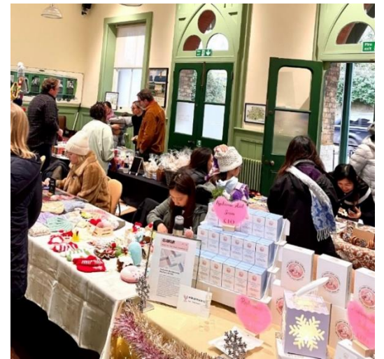
Christmas Craft Market

Father Christmas made his special appearance at the Station on the 10th December, bringing all his Christmas cheer and presents for children who visited him in his wonderful grotto. As part of the event, children could make Victorian inspired crafts such as Christmas crackers, paper angel decoration, and Christmas cards for Father Christmas. Children had a wonderful time meeting him and learning a little about how Christmas through the Victorians. I would like to thank our Father Christmas, who kindly gifted his time to make all the children and families very happy! If you'd like to see the cards made at the event, they are on display in the Station Cafe.