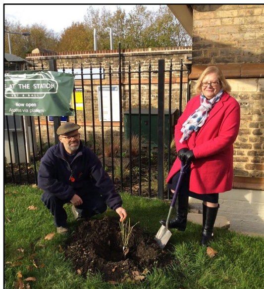
The Mayor and Town Clerk planting 'Reine Victoria' roses