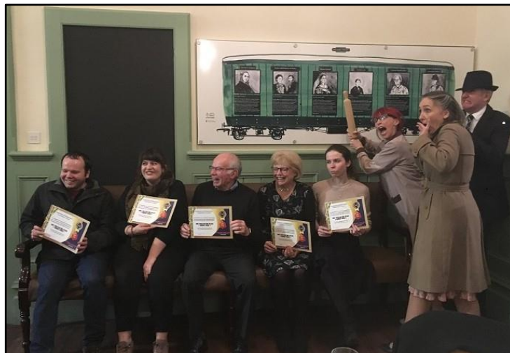
Kings Cross - The winning team