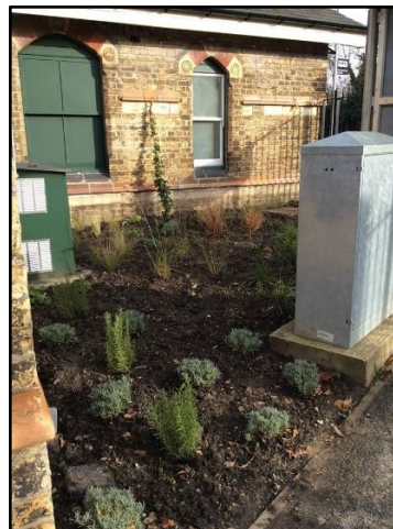
Station entrance - before and after planting