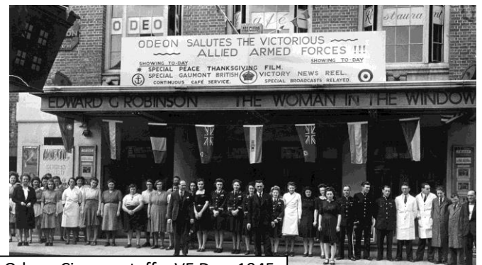
Odeon Cinema staff – VE Day, 1945

Players – Gilbert & Sullivan's "Trial By Jury" and "HMS Pinafore". However the Action Group wasn't successful and didn't make enough money to repay the £100,000 necessary to fund their lease to the District Council. It closed again in September 1984 and re-opened on 25th June 1985 with a play "Inherit The Wind" after the present stage and backstage areas were built by Deacons, the developers of the Waitrose store for a nominal £45,000. The Stag survived because of the generosity of the District Council leasing the Stag back to the Action Group for just £4,000 per year.