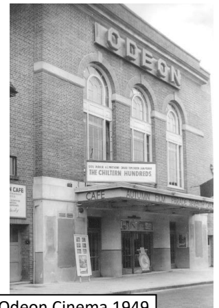
Odeon Cinema 1949

sixties the Odeon had become and now remains the only cinema in Sevenoaks. However during the Seventies it began a long decline as so many cinemas of the time did. In 1972 the stalls were split off into two smaller screens with the circle remaining as the main screen. Despite this the decline in audiences