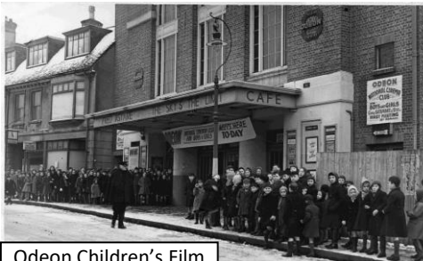
Odeon Children's Film Club December 1944