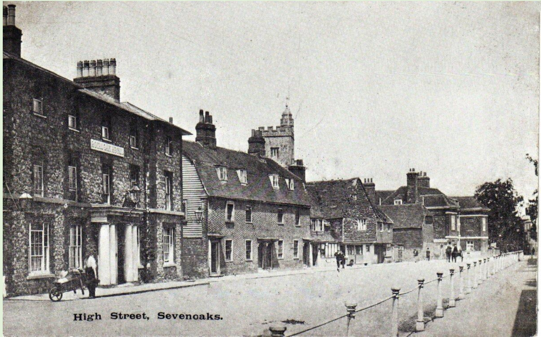
High Street, Sevenoaks.