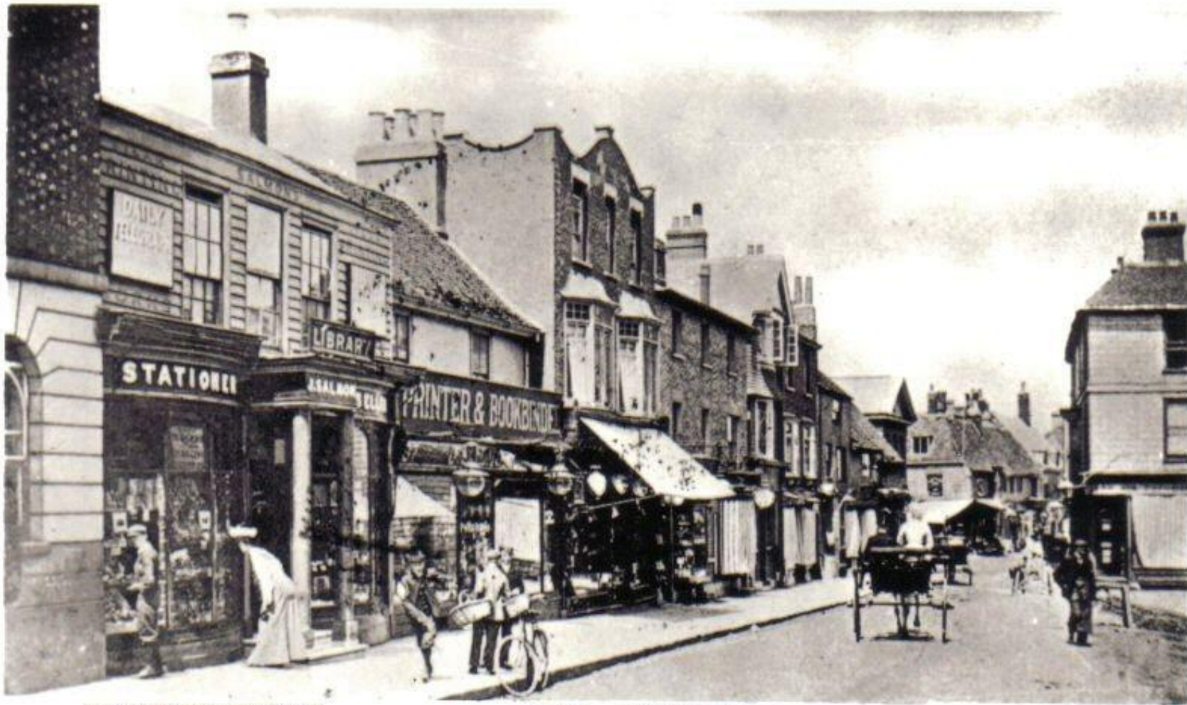
SEVENOAKS SOCIETY Postcard Series No. 1