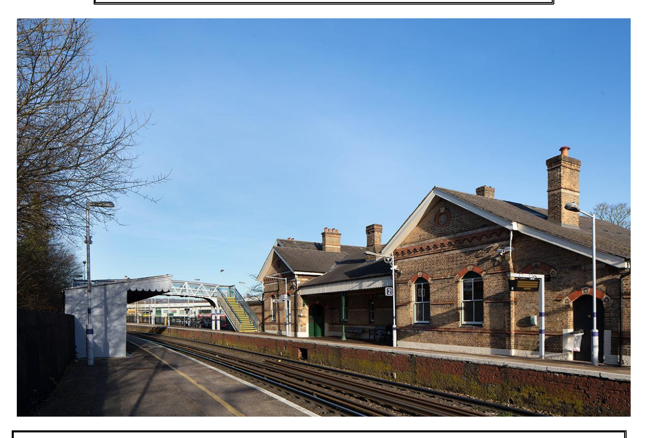
2019- the footbridge is still in place, but the canopy was removed